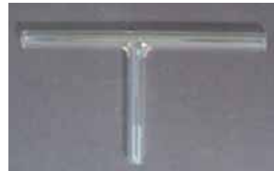
C10-1000 et seq