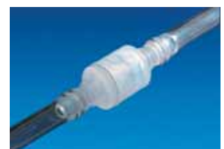
C10-2410 et seq