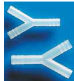
C10-2110 et seq