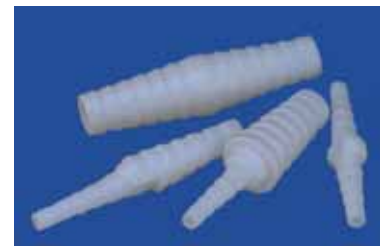
C10-1200 et seq