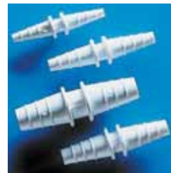
C10-1510 et seq