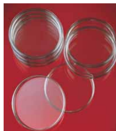
C35-2200 et seq