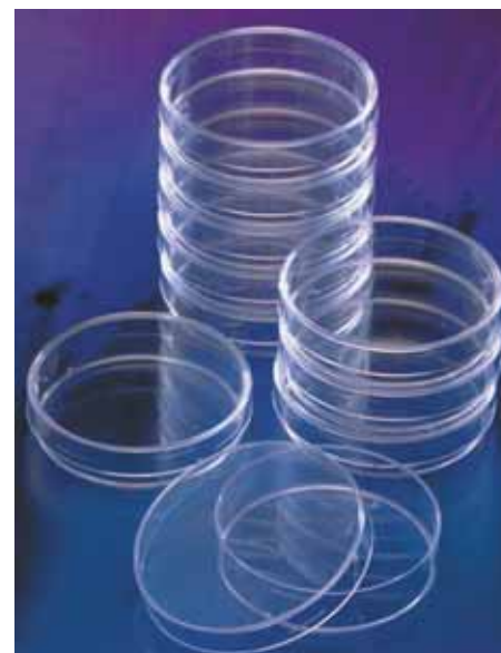
C35-0820 et seq