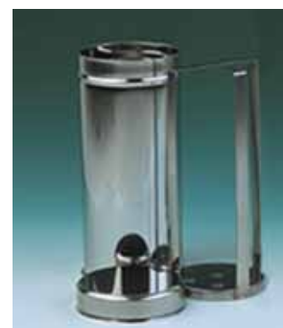
C35-2600 et seq