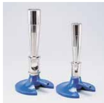
C21-2700 & C21-3000