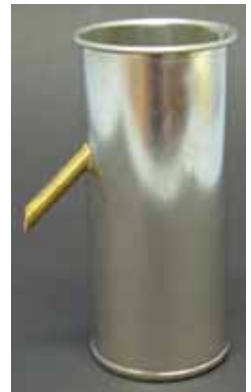
P11-0610 & P11-0615